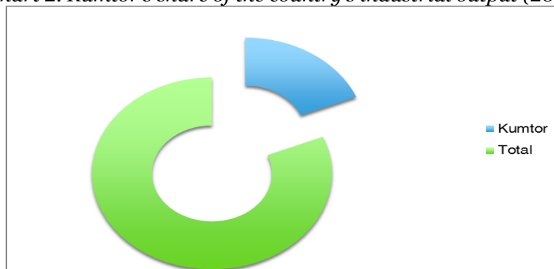
Chart 2. Kumtor's share of the country's industrial output (2014)