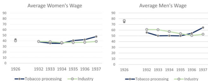
Graph 2. Men's and women's wages in the Bulgarian tobacco industry in comparison with the average industrial wage (levs per day). 31

a consequence of the collective agreements, but to a lesser extent than men's wages (see Graph 2). Thus, following the introduction of the tonga system in the early 1930s, the gender pay gap in the Bulgarian tobacco industry narrowed significantly: In 1926, women tobacco workers earned, on average, 57.33 percent of a man's wage, while in 1932 it was 68.48 percent. The gender pay gap was smallest just before the introduction of the industry-wide collective agreements in 1935, when women earned an average of 81.25 percent of men's wages. After 1937, the gender pay gap increased to around 74–77 percent (see Graphs 1 and 2).