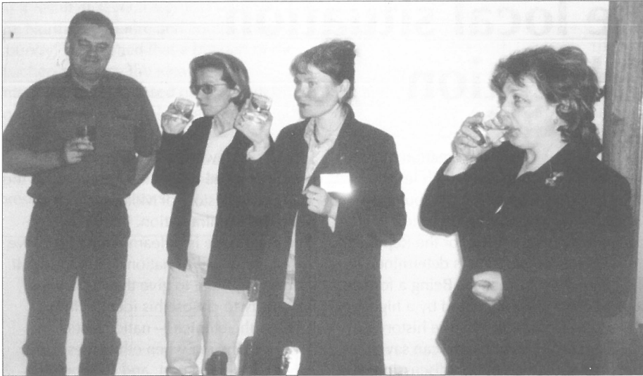
Celebrating 10 years of EUROCLIO during the seminar of the project New Times, New History in Ukraine.

the cultural identity of their foremother: what forms of culture did she participate in (books, films, music, fashion consumer cultures, etc.) and whether these forms of culture were nationally or ethnically connotated? They were invited to collect material that might help to understand the connections between popular culture and personal memories.