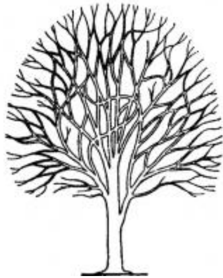
Figure 2 : Kroeber’s tree of knowledge (from Kroeber 1948: 260).

Kroeber (1948: 260) postulated a similar network structure for culture, and depicted it, as in Figure 2 : as a tree—at that time the most conventional depiction of differentiating structures. He described it as the “tree of [the knowledge of good and evil—that is, of human] culture” and wrote of its form: “There is a constant branching-out, but the branches also grow together again, wholly or partially, all the time. Culture diverges, but it syncretizes and anastomoses too” (ibid.). Science too is a form of culture that evolves as a system of inheritance of knowledge with differentiation and local integration.