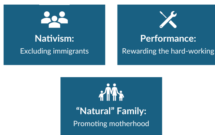
Figure 1. Common discursive frames of illiberal parties related to welfare.

In line with the existing literature, we have found three common discursive frames in the four countries (see Figure 1).