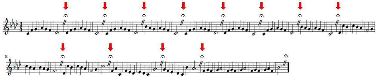
Fig. 1. Melody stimulus notation. Locations of the 12 pauses included in analyses are indicated by red arrows. The final indicated fermata was not analysed because there were no subsequent tone onsets and is therefore not indicated with an arrow.

to ensure synchronization between EEG and behavioural data streams. TTL triggers from MIDI keystrokes were sent at every keystroke onset. These triggers were 0.5 milliseconds in duration, hence the acquisition of EEG data at 5000 Hz. All EEG data and MIDI TTL triggers were sent from the USB2 adapter to BrainVision Recorder Software from Brain Products (v1.20.0801) running on a Windows OS (Win 7 Professional SP1).